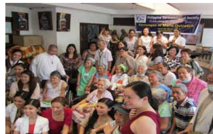
Outreach gift-giving mission at Kanlungan ni Maria, Antipolo City, last April 2012