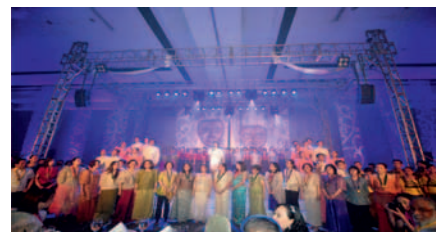
20th Regional Conference of Dermatology (Asian-Australasian) hosted by the Philippines Dermatological Society last February 2012

Sixty years of meaningful existence is perhaps a rarity, especially among people of diverse personalities and inclinations. Our society has soared in unity and camaraderie, and we fervently hope it will continue to do so.